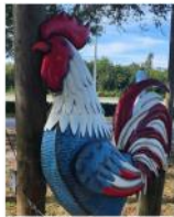
Recording Secretary TBA