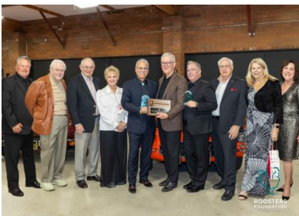
Roosters Board of Directors 2025