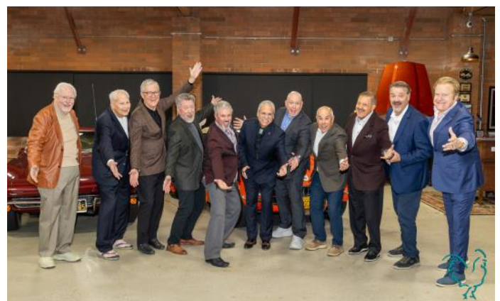
Roosters Board of Directors 2024