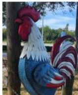
Recording Secretary TBA